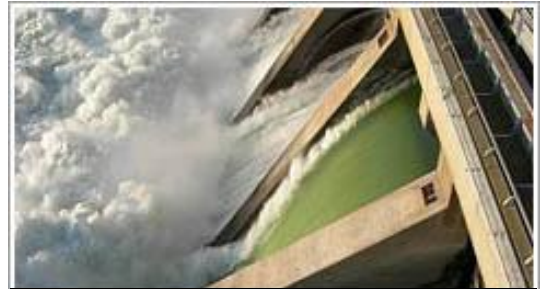
The smooth green water of a fish weir (closest spillway) lets young salmon slide over a dam in the surface water they prefer.

Young migrating salmon traveling near the water's surface now slide over the four lower Snake River dams plus McNary and John Day dams on the Columbia via spillway weirs . Standard spillways require fish to dive 50 to 60 feet below the surface to find their way through, but the weirs let fish remain near the surface and pass in a quicker and less-stressful ride. While more than 97 percent of juveniles survived passage through the standard spillway at Lower Monumental Dam in 2008, virtually 100 percent survived passage through the fish slide there.